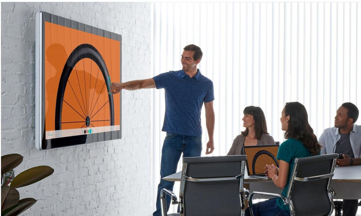
Figure 1. White Boarding Capability on the Cisco Webex Board 70

The Cisco Webex™ Board is an all-in-one device that provides everything you need to collaborate with your teams in physical meeting rooms. You can wirelessly present, white board, and have video and audio calls. And it securely connects to your virtual teams through the Cisco Webex service, via your Cisco Webex Teams app, so you can take your meetings and content on the road.