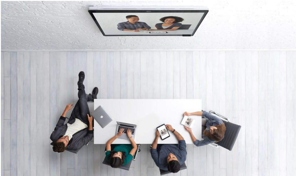
Figure 2. Video Conferencing on the Cisco Webex Board

The Cisco Webex Board is the latest addition to the portfolio of Cisco video and audio conferencing devices that register to Cisco Webex including the Cisco MX and SX Series, the Cisco Webex DX80 , the Cisco IP Phone 7800 and 8800 Series, and the Cisco Webex Room Series .