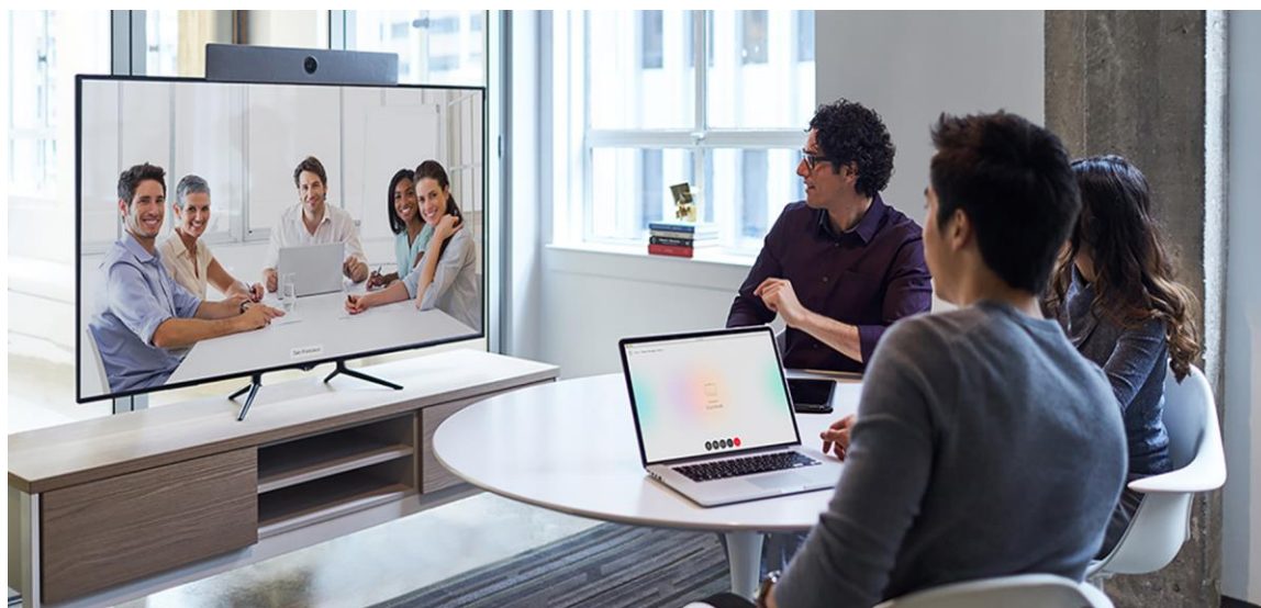
Figure 1. Cisco Webex Room Kit in small room scenario

The Room Kit – which includes camera, codec, speakers, and microphones integrated in a single device – is ideal for rooms that seat up to seven people. It offers sophisticated camera technologies that bring speaker-tracking capabilities to smaller rooms. The product is rich in functionality and experience but is priced and designed to be easily scalable to all of your small conference rooms and spaces – whether registered on the premises or to Cisco Webex.