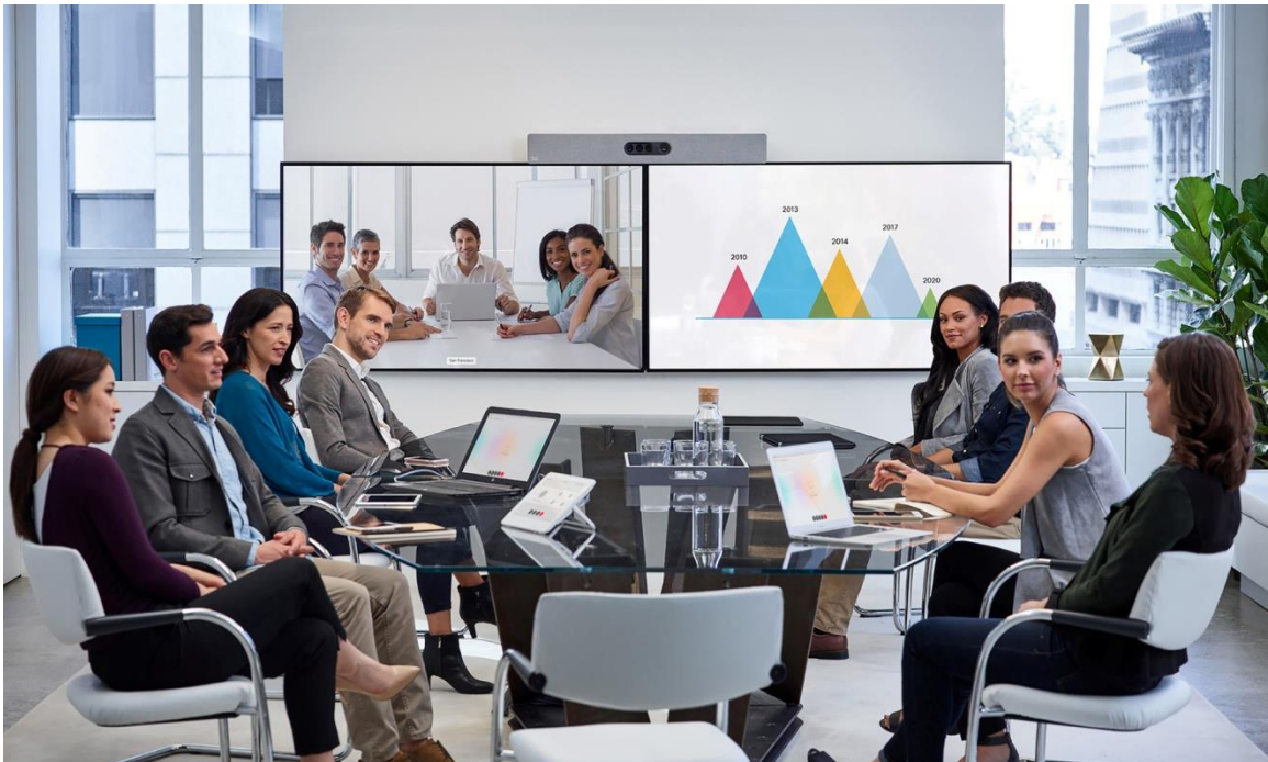
Figure 1. Cisco Webex Room Kit Plus in Large Conference Room

The Room Kit Plus – comprising a powerful codec and a quad-camera bar with integrated speakers and microphones* – is ideal for rooms that seat up to 14 people. It offers sophisticated camera technologies that bring speaker-tracking and auto-framing capabilities to medium to large-sized rooms. The product is rich in functionality and experience but is priced and designed to be easily scalable to all of your conference rooms and spaces – whether registered on the premises or to Cisco Webex.