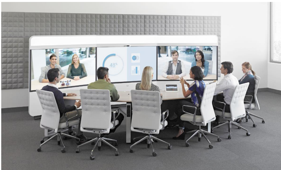
Figure 1. Cisco TelePresence IX5000, Six-Seat System

This sleek and powerful system incorporates an elegant triple 4K Ultra High Definition (UHD) camera cluster, three high-definition 70-inch LCD screens, and theater-quality audio to bring people together as if they were just across the table. The IX5000 Series includes the single-row, six-seat IX5000 system, and the dual-row, 18-seat IX5200 system.