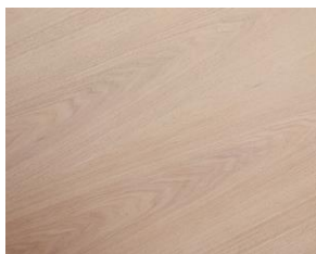
Figure 3. IX5000 Series Walnut Table Wood Option