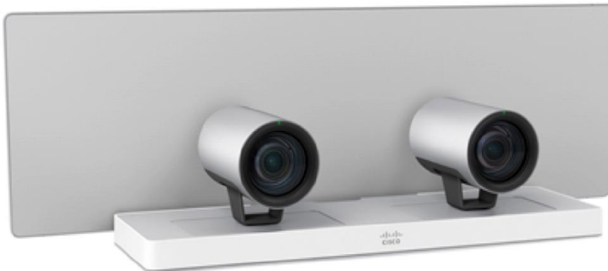
Figure 1. Cisco TelePresence SpeakerTrack 60

The Cisco TelePresence portfolio is designed to create a delightful in-person experience over the network - empowering you to collaborate with others like never before. Through a powerful combination of technologies and design that lets you and remote participants feel as if you are all in the same room, the Cisco TelePresence portfolio can transform your business. Many organizations are already using it to promote productivity and innovation.