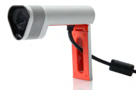
Polycom EagleEye Acoustic Camera