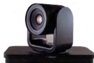
Polycom EagleEye IV 4x Camera (black)