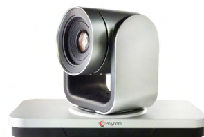
Polycom EagleEye IV 12x Camera (silver)

The Polycom EagleEye Acoustic camera is an optimal solution for a smaller environment. With built-in microphones and small footprint, this camera will easily blend into an executive office or huddle room.