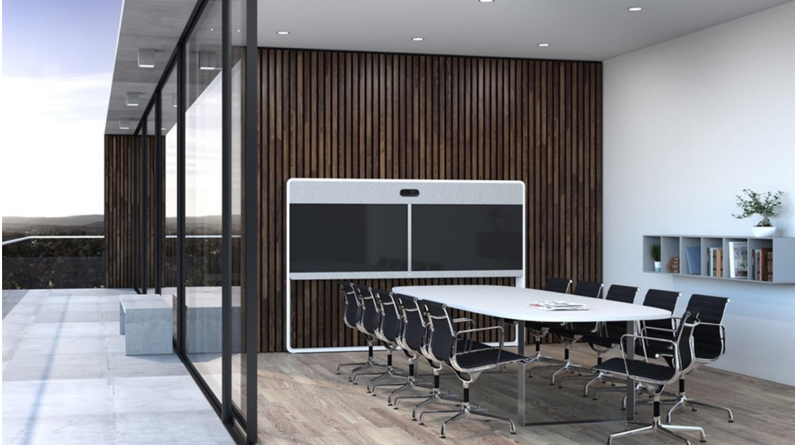
Figure 2. Cisco Webex Room 55 Dual in a large conference room