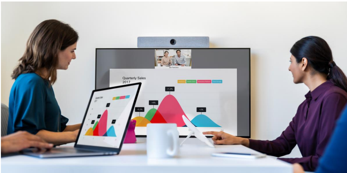
Figure 1. Cisco Webex Room Kit Mini in a small room

The Room Kit Mini is ideal for huddle spaces with three to five people because of its wide 120-degree field of view, which allows everyone in a huddle space to be seen. It also offers the flexibility to connect to laptop-based video conferencing software via USB. The Mini is tightly integrated with the industry-leading Cisco ® Webex platform for continuous workflow, and can register on premises or to Cisco Webex in the cloud.