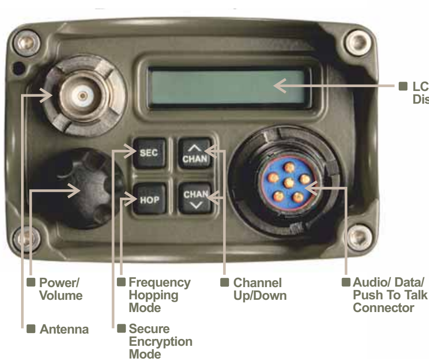
Advanced tactical handset for operation and field programming with U-229 style connector