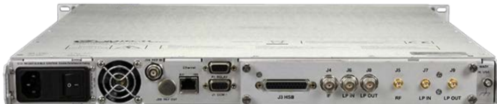
Typical Back Panel

The converters use our patented "Daisy Chain" integrated switching technology. The Daisy Chain design removes the relays associated with a centralized protection switch tray and distributes them across the individual converters. Daisy Chain technology successfully eliminates a central switching chassis, two power supplies, a microprocessor, and several long, costly cables. Widely accepted in the industry, Comtech EF Data's Daisy Chain provides both pricing and marketing advantages.