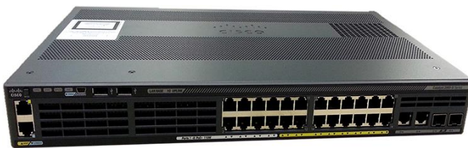
Figure 4. Fanless Quiet Cool 24-Port PoE Switch

The Cisco Catalyst 2960-X Series adds a new member to its 2960-X family, the WS-C2960X-24PSQ-L (Cool). This is a 24-port 10M/100M/1000M switch that can power up to 8 ports of PoE (first eight ports only) with ability to deliver a sum total of 110W of PoE power. This switch has four Gigabit Ethernet uplinks: two of them SFP and the other two 10M/100M/1000M copper interfaces enabling choice of fiber or copper connectivity to the aggregation point. This switch ships with the Cisco IOS LAN Base image.