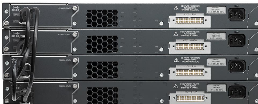
Figure 2. Cisco FlexStack-Plus Switch Stack