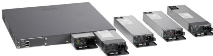
Figure 3. 2960-XR Family Power Supply

The following table shows the different power supplies available in these switches and the available PoE power.