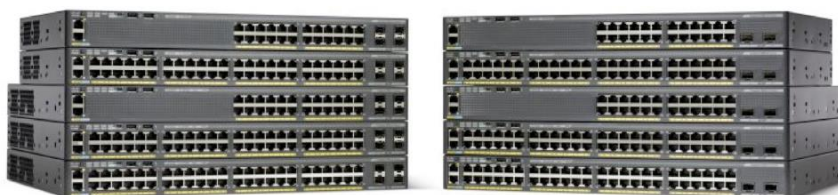
Figure 1. A Cisco Catalyst 2960-X Series Switch Family

Cisco® Catalyst® 2960-X Series Switches are fixed-configuration, stackable Gigabit Ethernet switches that provide enterprise-class access for campus and branch applications (Figure 1). Designed for operational simplicity to lower total cost of ownership, they enable scalable, secure and energy-efficient business operations with intelligent services and a range of advanced Cisco IOS® Software features.