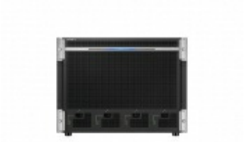
XVS-7000 Mid-range 4K/3G/HD video switcher for IP and SDI

* Mixed configuration of optional boards is available for six slots.