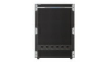
XVS-9000 Flagship 4K/3G/HD multi-format IP-ready video switcher