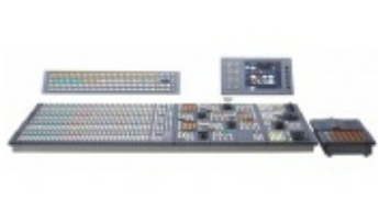
MVS-7000X High-end 3G / HD / SD switcher