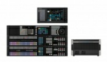
XVS-2M/E Pack 3G-capable, 4K-ready, IP-ready XVS Series Switchers in an affordable pack