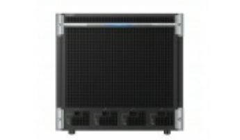
XVS-8000 High-end 4K/3G/HD video switcher for IP and SDI