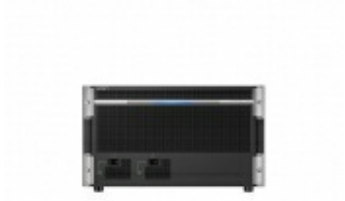
XVS-6000 Entry-level 4K/3G/HD video switcher for IP and SDI