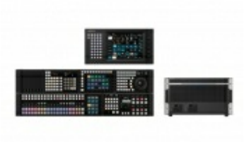
XVS-1M/E Pack 3G-capable, 4K-ready, IP-ready XVS Series switchers in an affordable pack