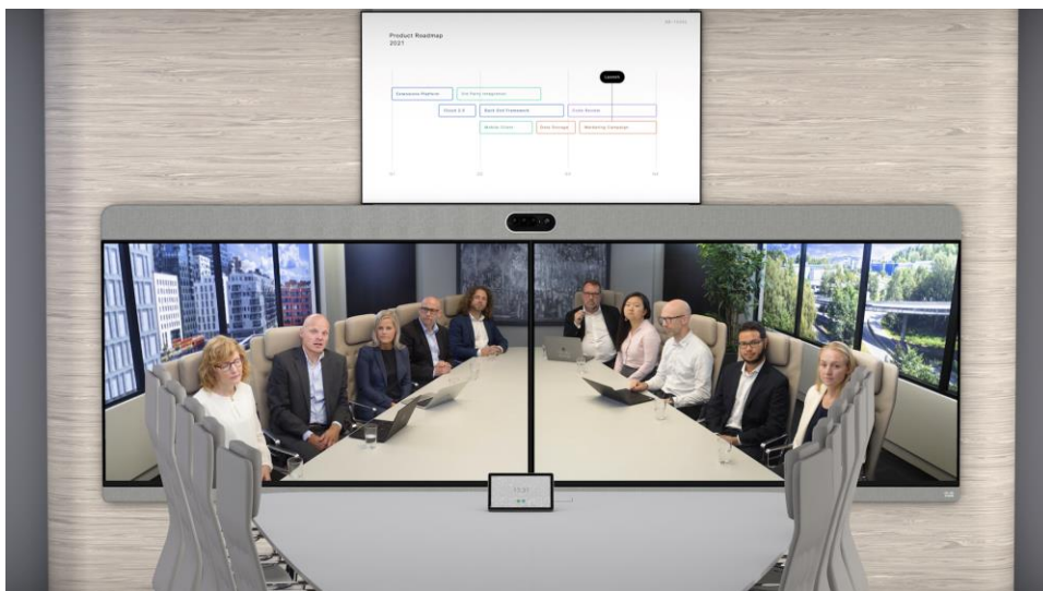
Figure 1. Cisco Webex Room Panorama overview