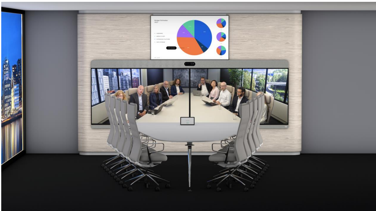
Figure 2. Cisco Webex Room Panorama in a large conference room